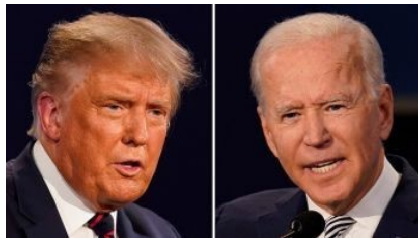
Decision 2020: Who do you support?

So if someone was at risk of committing suicide, the guns could be taken away temporarily. Right now there are a lot of people who have been discriminated against for a very long time. Improvements have been slow but many Americans see that those gains are reversing and life is becoming more unequal for people of color, women, and people in the LGBTQ+ community. It is important that all people in America have the same rights and responsibilities. If Joe Biden is elected he will enact many laws that help reduce violence, increase equal protection of the law, equality in the workplace and in school, and that all people have equal rights to health care. His administration will hope to set an example of tolerance and equity and return America to a symbol of equality to other nations around the world. The American public must make a decision in just a few weeks. With so many issues facing our country today, we need a president that knows leadership, hard-work, and compassion for the American people. Joe Biden is the right man for this choice. We can't allow Donald Trump to stand any longer.