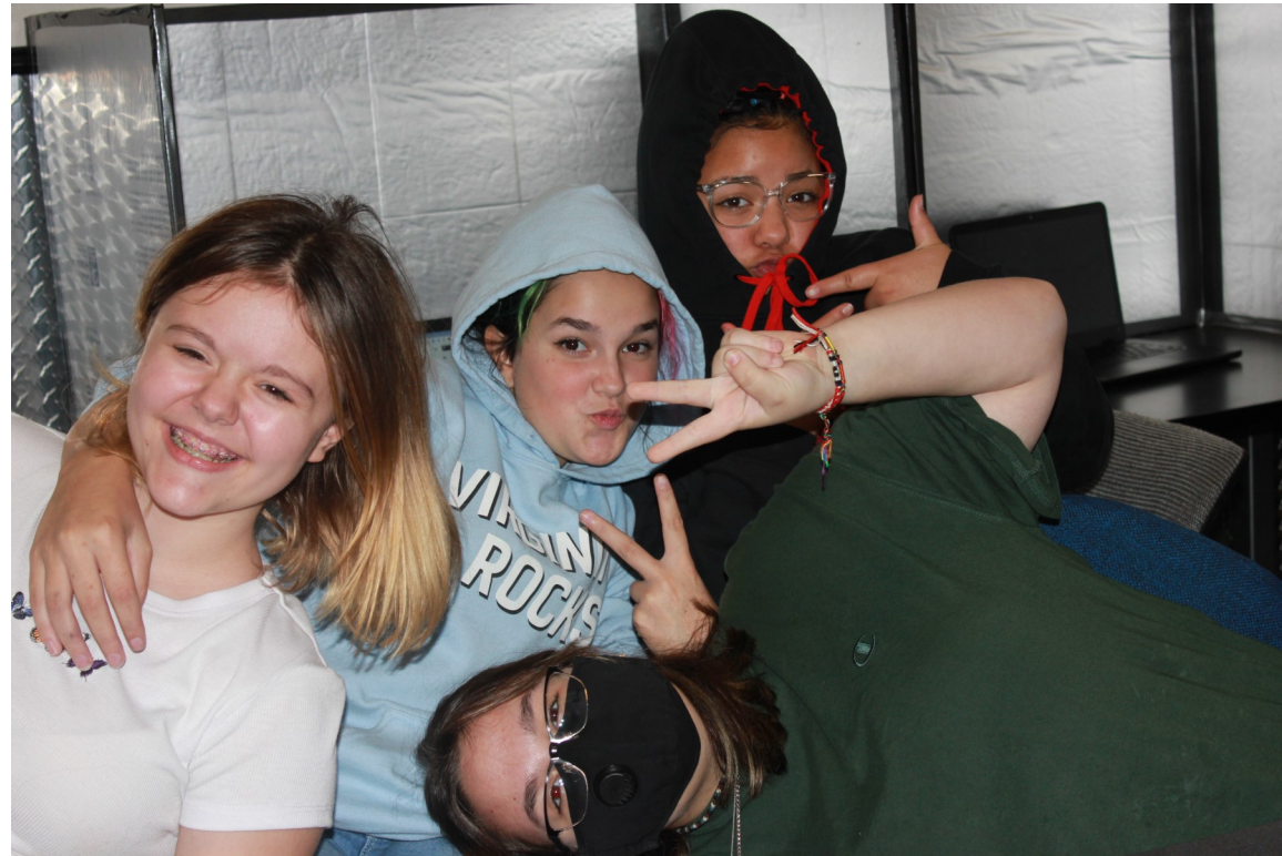
Newcomers to the Journalism class: