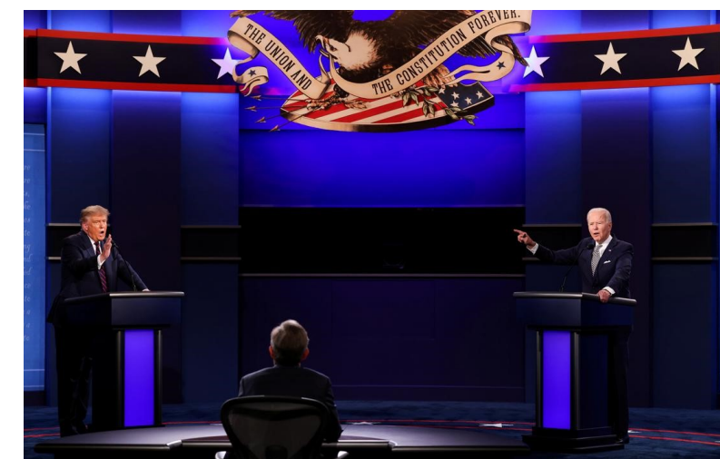
Chris Wallace moderates what became a raucous debate.